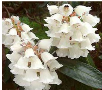
R. grande Some lucky FVRS member will soon have this in their garden, via the RSF spring distribution see pages 3 & 4 for details.